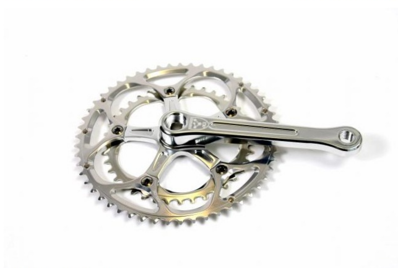
Genetic Heritage Double Crankset

If you've got a older bike that needs some love, then the Genetic Heritage double crankset will look just the ticket on your 1980s steel bike. It's not cheap, though, and the alternative – buying a real period crankset – may make the finished bike more authentic.